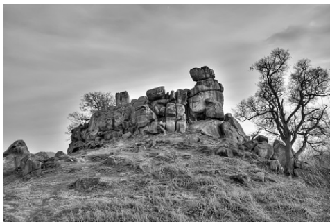
Robin Hood's Stride